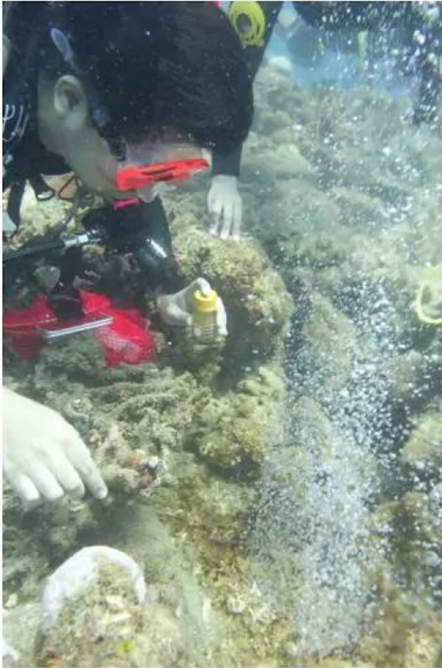
Tingloy Island, Philippines